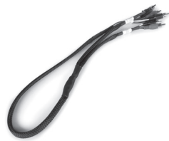
1-10823 AWMC3 Amplifier Harness