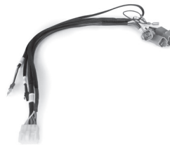
1-10825 AWMC3 Speaker Harness