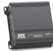
MUD100.4 4-Channel Amplifier