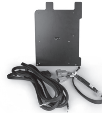
X3-17-CORE Amplifier Bracket Kit and Wire Harness