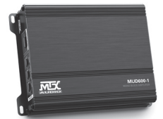
MUD600-1 Mono Block Amplifier