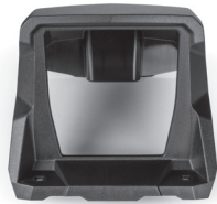
X3-17-DK AWMC3 Dash Kit