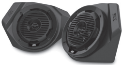
X3-17-FS-L Front Speaker Kit (Lower)