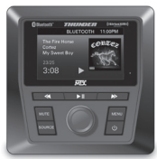
AWMC3 Bluetooth Media Controller